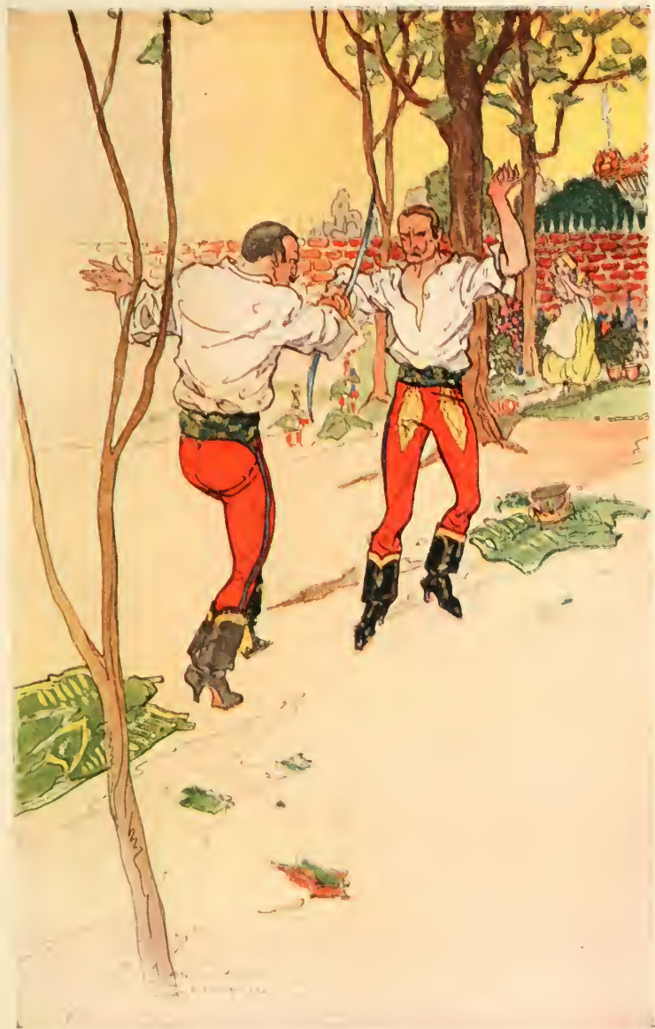
“The angry clash of arms filled that prim garden”